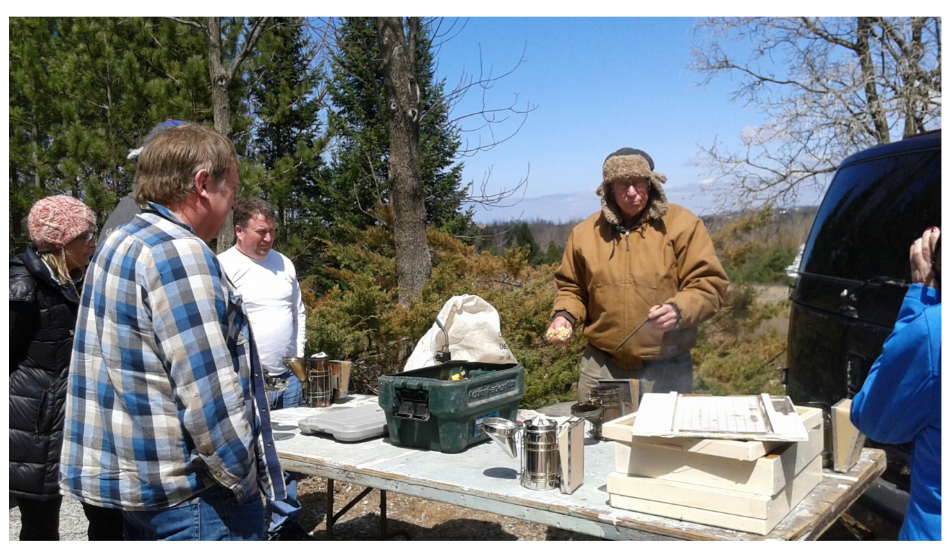
Mentees in our on-farm mentorship programs have all been out in the field recently, with the kick-off of our 2015 mentorship season!

Published on Farms at Work (http://farmsatwork.com)